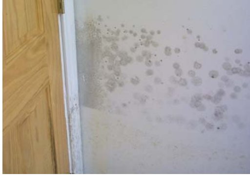
More typical mold growth is seen in the Tuskegee University test house where the flood lasted 3 days.