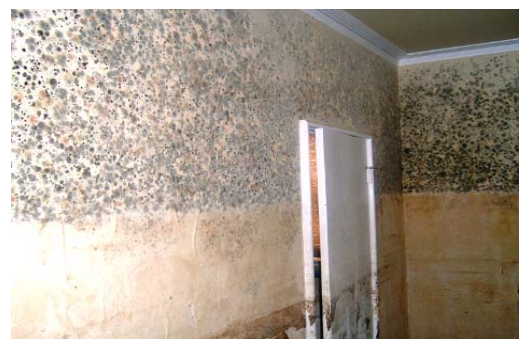
Mold growth can be very heavy as in New Orleans after Hurricane Katrina where the flood lasted 3 weeks.