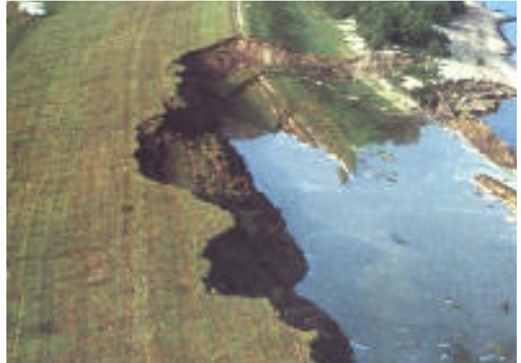
Levee Failure Mode Due to Site Conditions - Insufficient Set-back and/or Quick Drawdown

There is a national need for technically advanced levee assessment procedures and tools that can be easily and rapidly deployed in times of immediate need. Levee assessment procedures must be user-friendly and applicable to levees nationwide without restrictions to geographic location, levee geometry, or levee materials. Improved knowledge of levees conditions would significantly improve the allocation of resources to inspect, test, and repair those in most need. Rapid screening of levees is of utmost importance to locate subsurface area weaknesses before any adverse conditions arise and threaten levee stability, public safety and built infrastructures. This research and development effort will result in new methods and tools to help infrastructure managers prioritize their tasks.